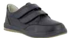
82120 Memphis Page 57