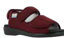
58892 Genf Page 30