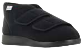
60490 Genua XXL Page 19