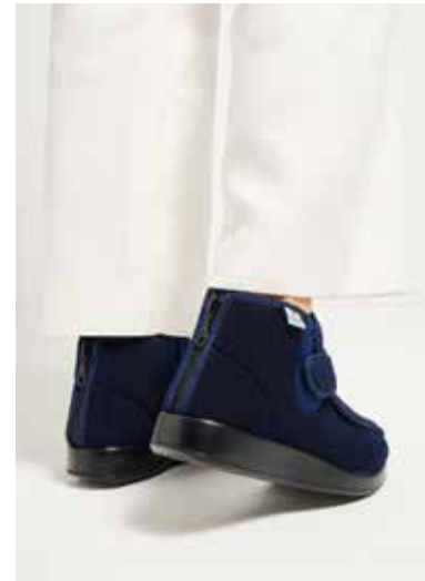
Split heel cap with a zip to make it easy to slip the shoes on