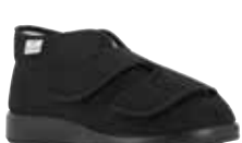
60922 Parma Page 27