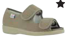
58882 Göteborg Page 31