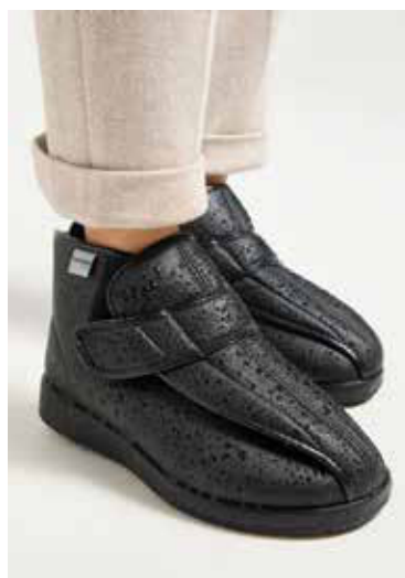
Water-repellent and wipeable imitation leather