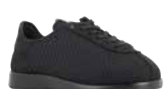
60831 Rhodos Page 26