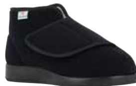
60410 Roma XXL Page 23