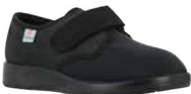
60810S Tromsö 60 black Page 35