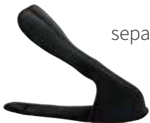
separate toe protector 60321