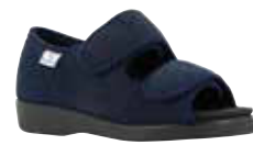
58881 Stockholm Page 32