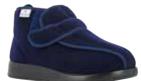
60910S Meran 25 navy blue Page 24