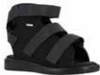
60320 lymph sandal Page 37