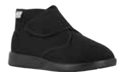
60820 Vancouver Page 34