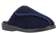
58906 Bali Page 29