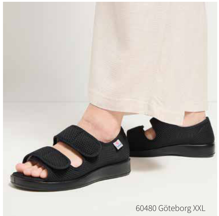
60480 Göteborg XXL