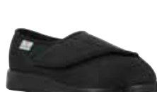
60960 Lindau Page 27