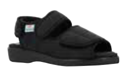
58890 Lugano Page 30