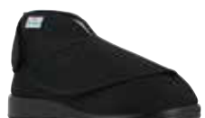
60882 Florenz Page 26