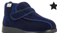
60910 Meran Page 24