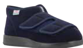
60920S Genua 25 navy blue Page 19