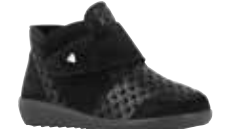
77371 Grenada Page 42