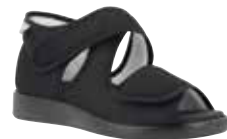
60470 Hamburg XXL Page 34