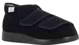
60920S Genua 60 black Page 19