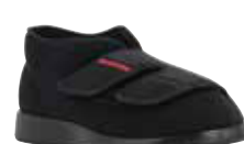
60920 Genua Premium Page 28