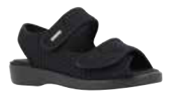
58896 Mailand Page 32