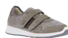
87221 Trenton Page 43