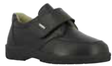
75150 Brüssel Page 54