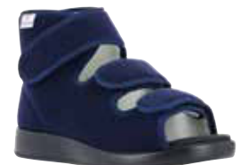
60450 Rijeka XXL Page 34