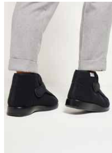
Closed heel without a zip