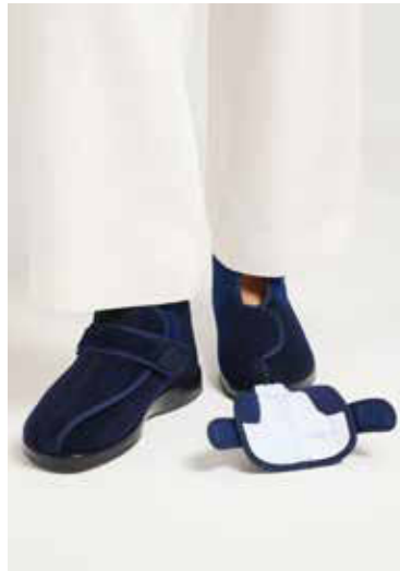
Cannot be opened up to the edge of the sole