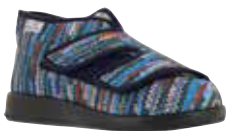
60926 Belfast Page 20