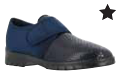
31311 Strasbourg Page 40