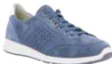
88130 Nashville Page 56