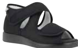
60470 Hamburg XXL Page 34