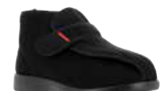
60910 Meran Premium Page 28