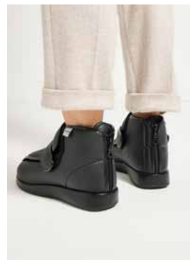
Split heel cap with a zip to make it easy to slip the shoes on