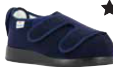
60420 Dublin XXL Page 23