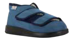
60928 Genua Winter II Page 20