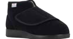
60410 Roma XXL Page 23