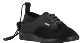
60310 lymph lace up shoe Page 37