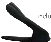
including toe protector 60321