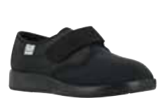
60810 Tromsö Page 35