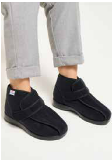
Special width R offers even more volume (+1 cm toe height)