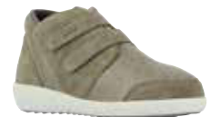
77351 Lyon Page 42