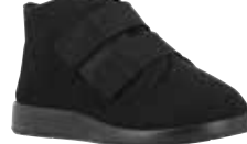
60970 Innsbruck Page 21