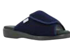
58900 Ibiza Page 29