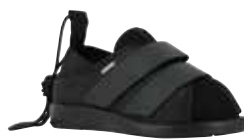
60330 lymph velcro shoe Page 37