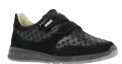
87280 Ennis Page 43