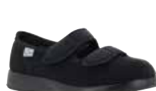
60210 Sorrent Page 27