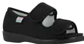
58882S Göteborg 60 black Page 31