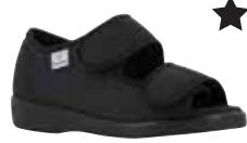
58880 Malmö Page 32