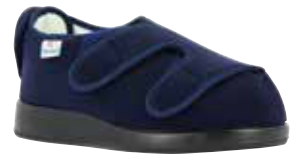
60420 Dublin XXL Page 23