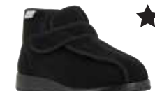
60460 Meran XXL Page 24