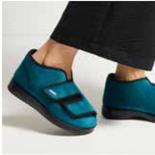
60919 Genua Colour