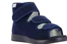
60450 Rijeka XXL Page 34