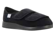
60650 Genua Slipper Page 19