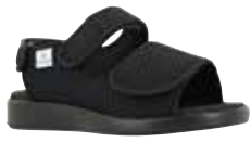
60430 Lugano XXL Page 30