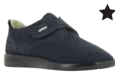
60815 Teneriffa Page 40