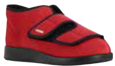
60919 Genua Colour Page 18