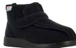
60910S Meran 60 black Page 24