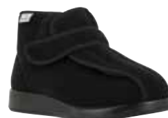
60460S Meran XXL 60 black Page 24