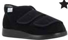
60920 Genua Page 19