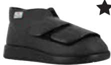
60924 London Page 21