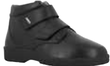
75500 Wien Page 54