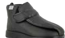
60912 Meran Protect Page 24