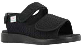
60430 Lugano XXL Page 30