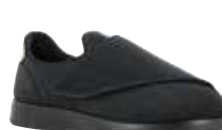
60961 München Page 26