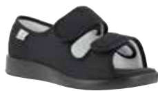
60480 Göteborg XXL Page 31