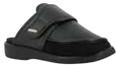
58907 Grenoble Page 33