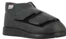
60929 London Winter Page 21