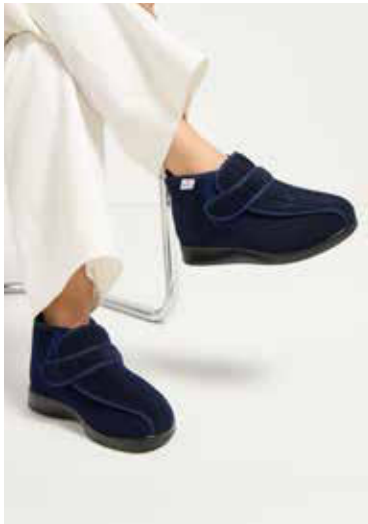
Bandage shoe width L provides plenty of volume