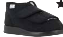
60925 Genua Winter I Page 20