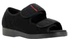
58880 Malmö Premium Page 28