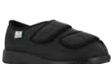
60930 Garmisch Page 23