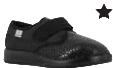
60811 Zürich Page 35