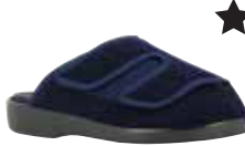
58908 Kopenhagen Page 29