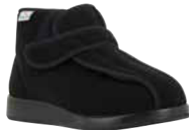
60460 Meran XXL Page 24