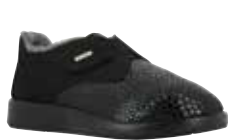
60817 Zürich Winter Page 35