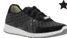
87112 Kioto Page 43