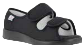
60480 Göteborg XXL Page 31