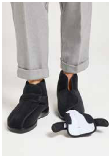
Opened up to the edge of the sole