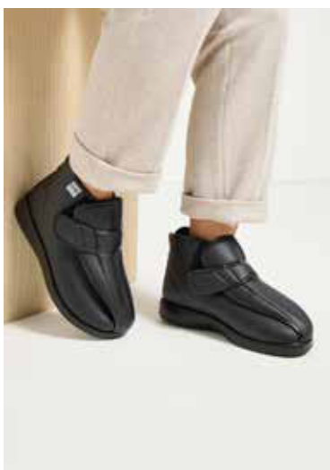
New version of the popular model 60910 Meran in width L